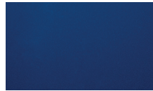
Galaxy Blue Pearl