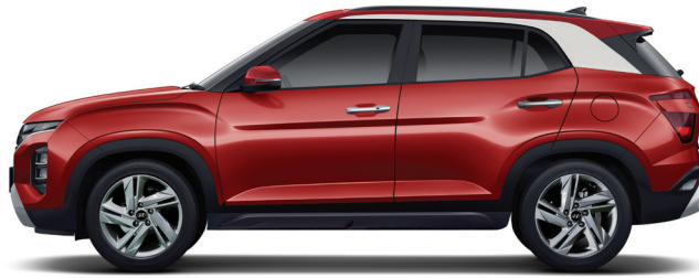
Wheelbase - 2,610