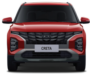
Front Wheel Tread - 1,572