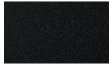
Midnight Black Pearl