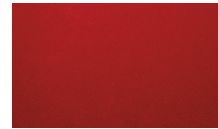
Dragon Red Pearl