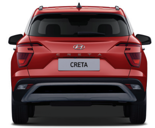
Rear Wheel Tread - 1,576