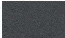
Titan Grey Metallic